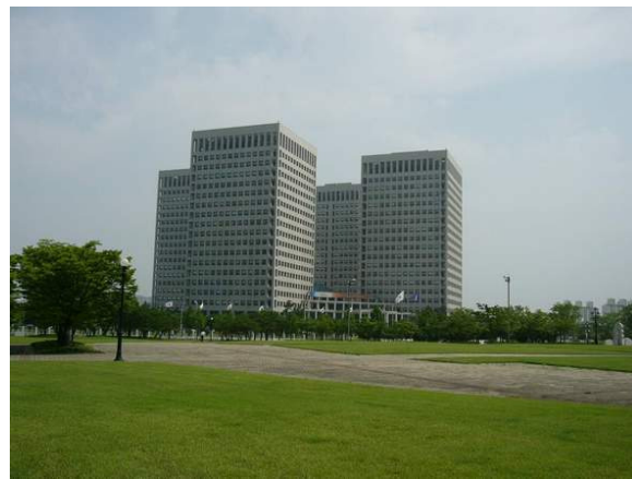
<Government Complex in Daejeon>

Step 2) Get off at the Government Complex Daejeon Bus Stop.