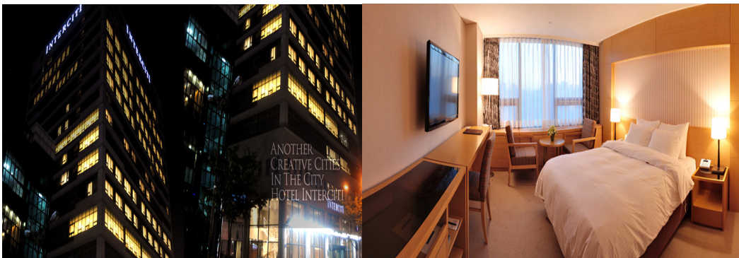
< Hotel Interciti >

Statistics Korea provides accommodation for the invited participants, Hotel Interciti ( http://www.hotelinterciti.com/ , tel. +82(0)42 600 6000). Hotel Interciti is located at Oncheonmunhwagil, Yuseong-gu, Daejeon city, 15-20 minutes away from the venue by taxi. Breakfast is included. For the invited participants, pick-up service from/to the venue will be provided. On the 1 st day of the workshop(12nd), the shuttle bus will depart to the venue at 8:40am. The participants are asked to gather at the lobby of the hotel on time.